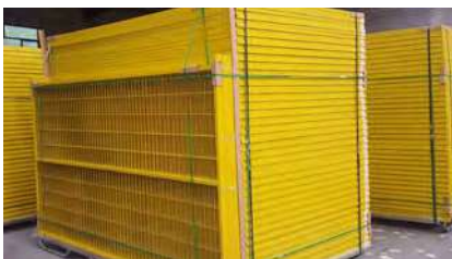
FENCE PANEL PACKAGE